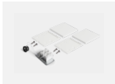
04-20102, B 2xend cap - plastic, 3- conductor terminal box, grommet