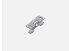
00-00600, F ceiling fastening for luminaires 132-5xxK, 04-2000x, 05-2000x, 09-200x - 1 piece