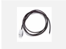
00-00500 wire for emergency lighting XX-XXXX-20