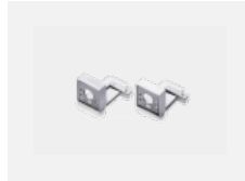
00-20700, B 2 pcs of wall fastening Lipo/Lina