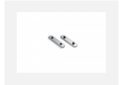
04-00200, N straight connector