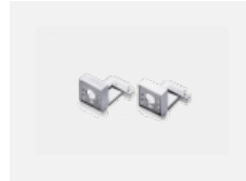
00-20700, B 2 pcs of wall fastening Lipo/Lina