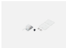
04-20101, W 2xend cap - metal, 5- conductor terminal box, grommet