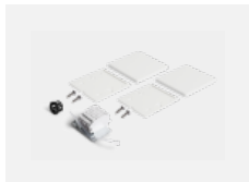
04-20103, W 2xend cap - plastic, 5- conductor terminal box, grommet