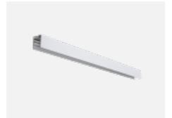
04-21303, W pendant profile for track luminaires; l = 1122mm