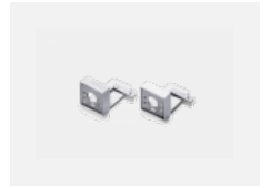
00-20700, B 2 pcs of wall fastening Lipo/Lina