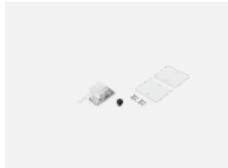
04-20101, W 2xend cap - metal, 5- conductor terminal box, grommet