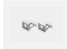
00-20700, B 2 pcs of wall fastening Lipo/Lina