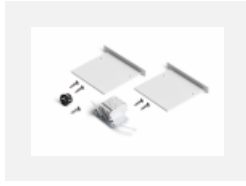
04-00101, W 2xend cap - metal, 5- conductor terminal box, grommet