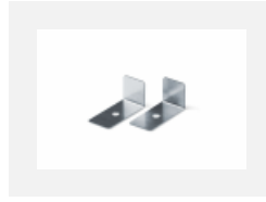
04-01200, F Accessory for gear-tray release