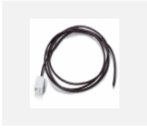
00-00501 wire for emergency lighting XX-XXXX-40