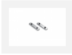
04-00200, N straight connector