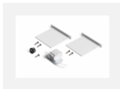
04-00101, W 2xend cap - metal, 5- conductor terminal box, grommet