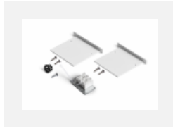
04-00100, W 2xend cap - metal, 3- conductor terminal box, grommet