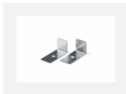
04-01200, F Accessory for gear-tray release