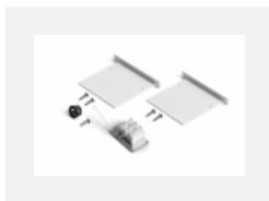
04-00100, B 2xend cap - metal, 3- conductor terminal box, grommet