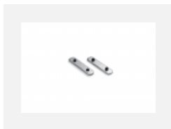
04-00200, N straight connector