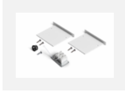
04-00100, S 2xend cap - metal, 3- conductor terminal box, grommet