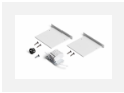
04-00101, B 2x end cap - metal, 5- conductor terminal box, grommet