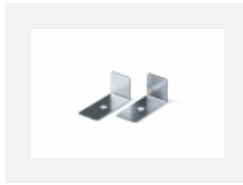
04-01200, F Accessory for gear-tray release