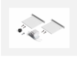
04-00101, S 2x end cap - metal, 5- conductor terminal box, grommet